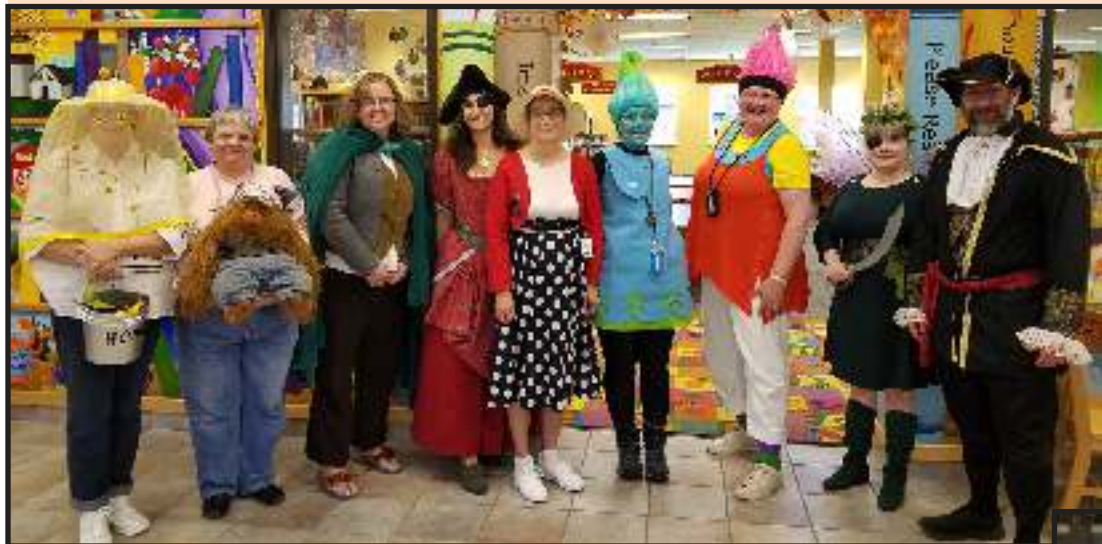
Library staff joined in the Halloween fun by dressing up for the occasion.