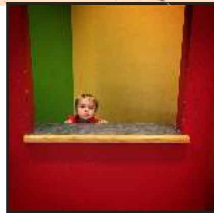
Peek-A-Boo in the kids room!