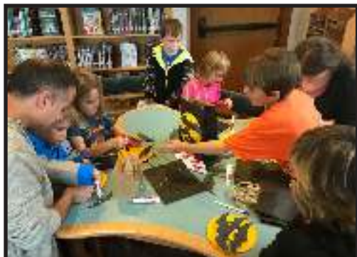
A Halloween craft in Pacific City.