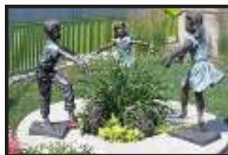
Dancing Children sculpture to be featured in park.

The park will actually become another community room for the library where we can hold programs in good weather. People will be able to enjoy the new outdoor area during the day until we close the park each evening. Please stop in at the Main Library to view the plans for the park project. We have so much to be excited about!