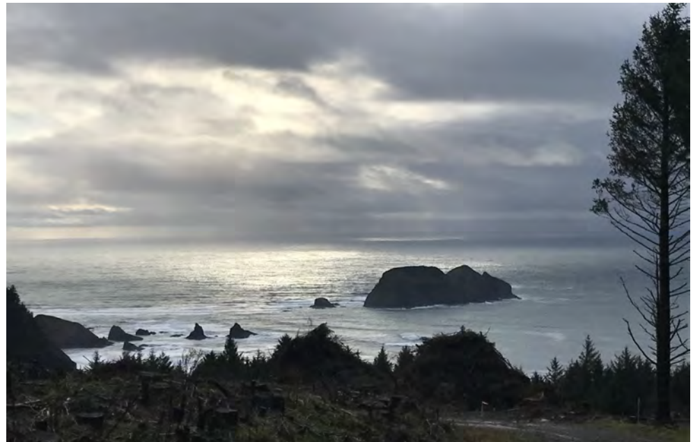
Above: The view from south side of the new roadway summit.

https://highways.dot.gov/federal-lands/projects/or/tillamook-b780-1