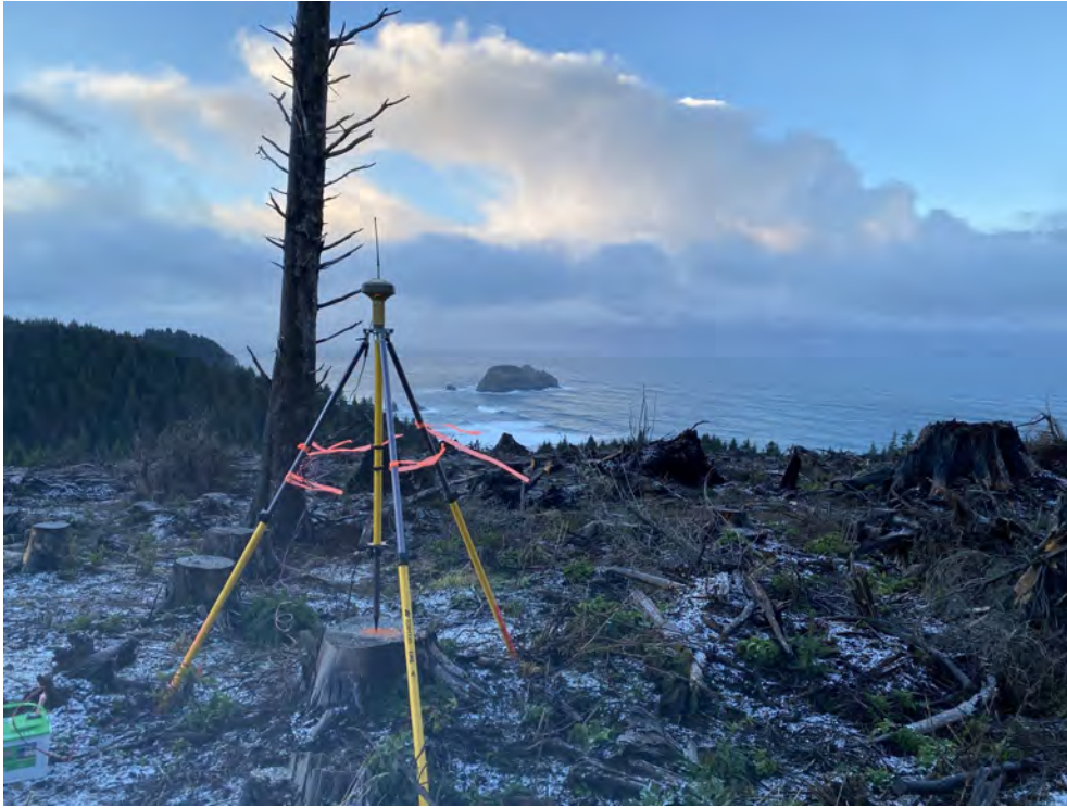
Base station set up for surveying