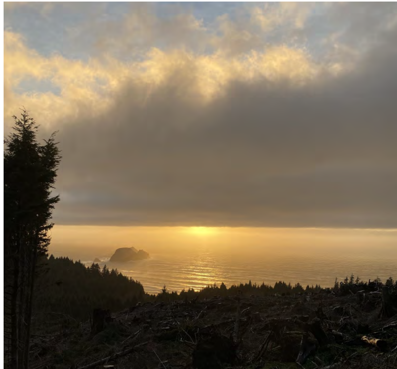
Sunset viewed from the South side of the project

https://highways.dot.gov/federal-lands/projects/or/tillamook-b780-1