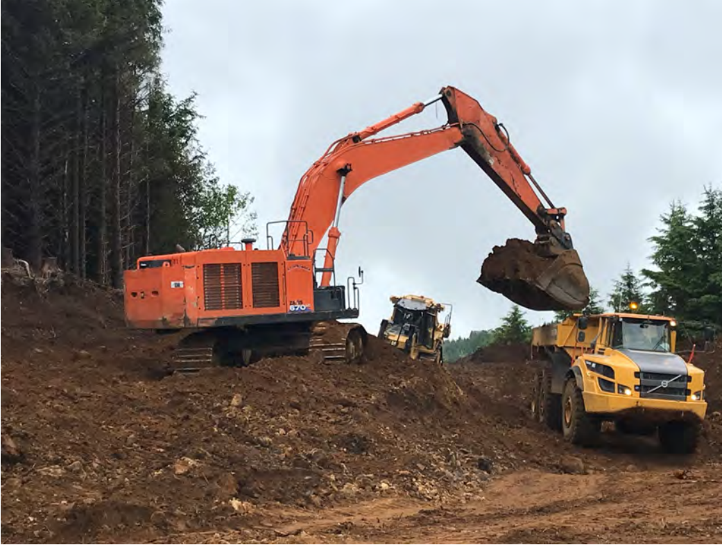
Excavation at sta- tion 355.