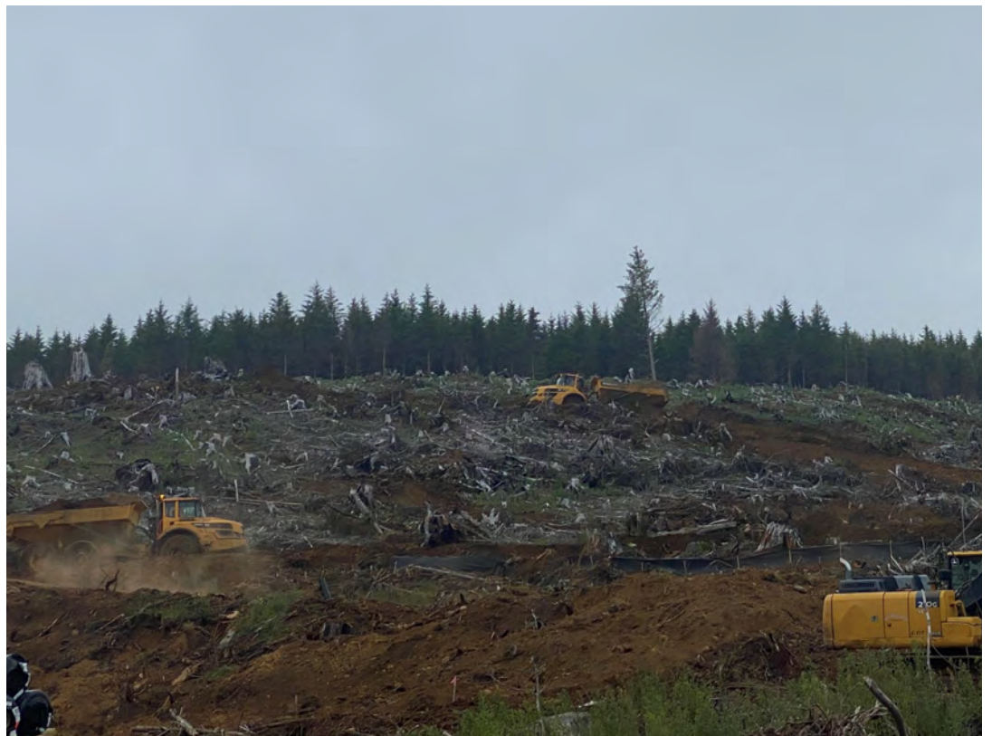
Equipment working at the waste site