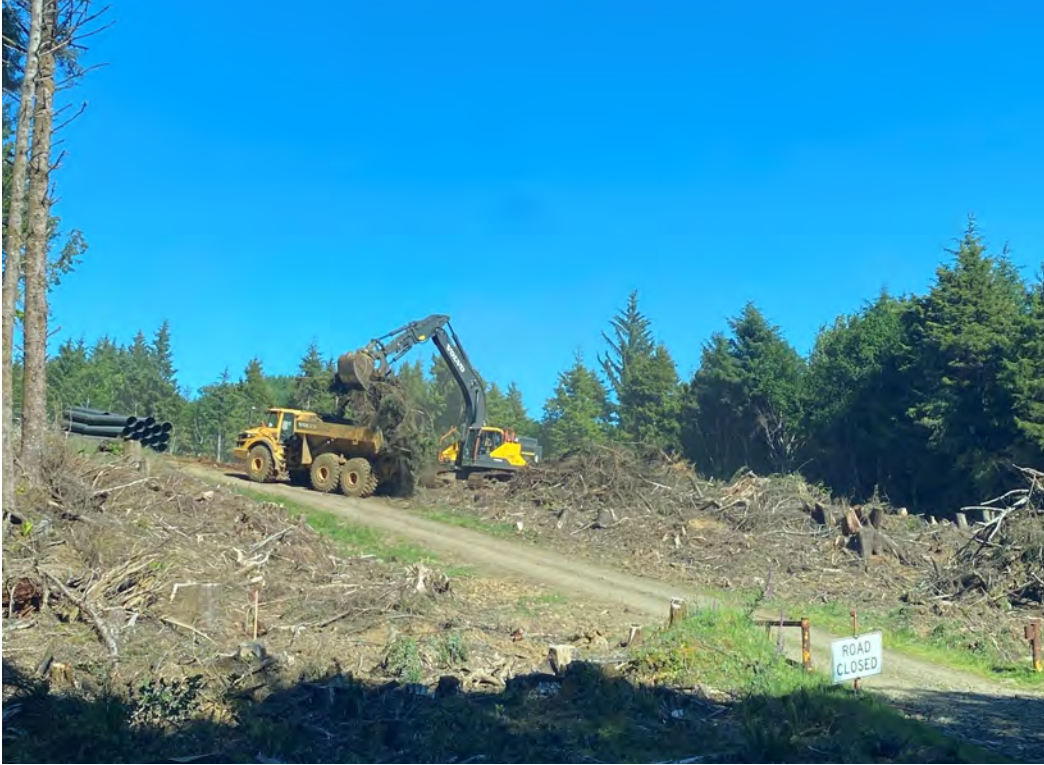
Excavator clearing timber slash and brush by the South entrance