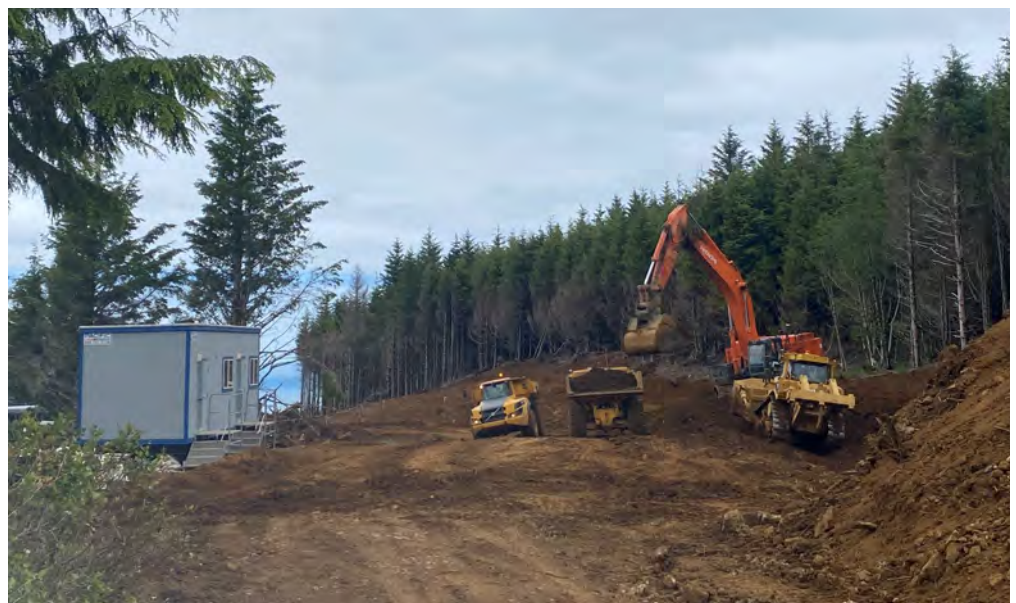
Excavation station 360.

https://highways.dot.gov/federal-lands/projects/or/tillamook-b780-1